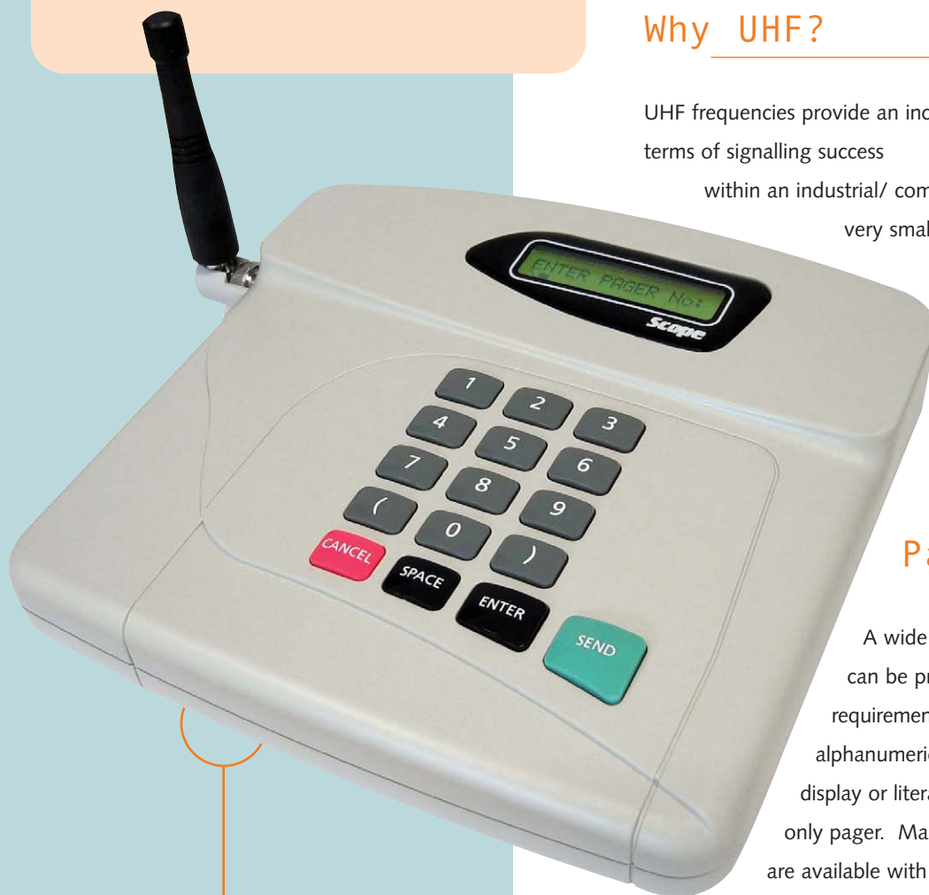
DataPage Lite transmitter

*Note that DataPage Lite can only send numeric characters.